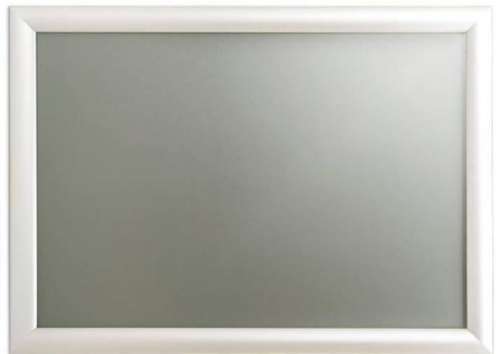
silver snap frame